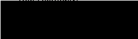
Cllr Roderick Hogarth Mayor of Sevenoaks